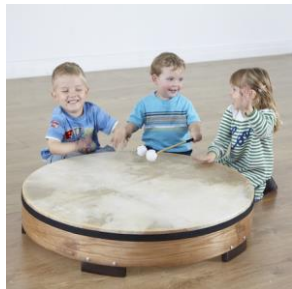
Gathering Drum Beaters 8pk MES1106